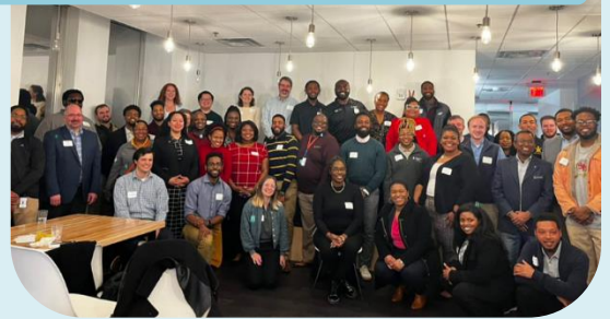
Networking Social with Gresham Smith