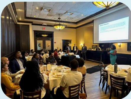
Financial Planning Workshop with Prudential